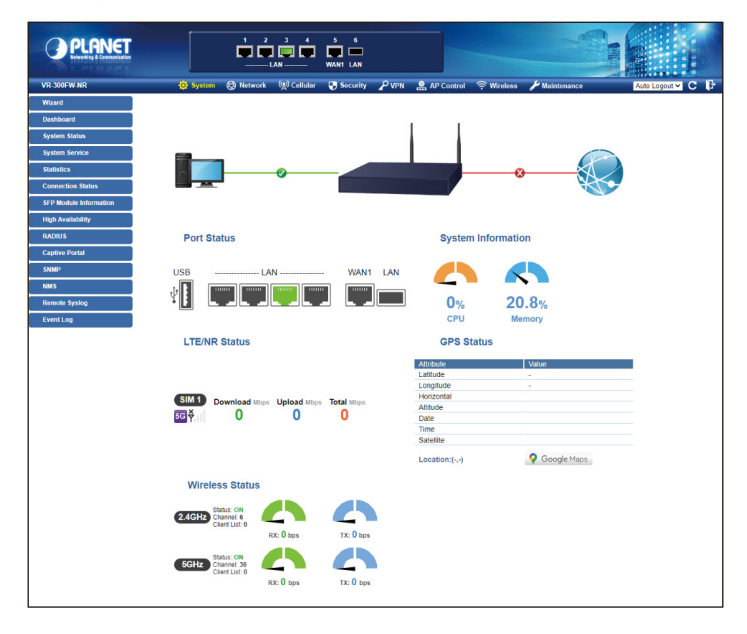
Figure 3-3: Web-based Main Screen of Cellular Gateway

Step 3: After entering the password, the main screen appears as shown in Figure 3-3.