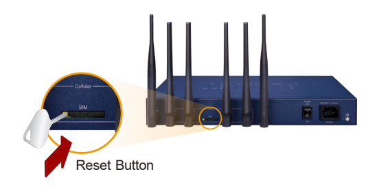
Figure 4-1: VR-300 Series Reset Button

To reset the IP address to the default IP address "192.168.1.1" or reset the login password to default value, press the hardware-based reset button on the front panel for about 10 seconds. After the device is rebooted, you can log in the management Web interface within the same subnet of 192.168.1.xx.